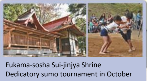
Fukama-sosha Sui-jinjya Shrine Dedicatory sumo tournament in October