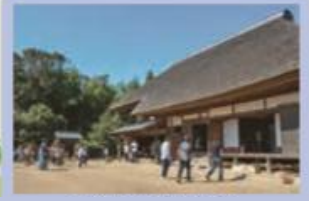
Chiba Openair Museum Boso no Mura

Become a Dora-mame soybean crop owner? As an owner, you can participate from the seed sowing until before harvesting. And just before harvesting, the 7,000 yen per approx. 25m 2 patch you bought will be handed over to you. Harvesting can be done whenever you like. If you harvest the dora-mame in October, you can taste the delicious boiled green bean edamame. And if you harvest in early December, you can enjoy the dried black bean used often for the sweetly cooked bean nimame which is a traditional New Year dish.