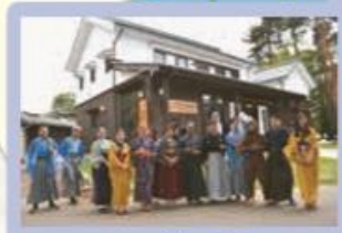
Cosplay no Yakata