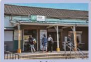
JR Ajiki Station