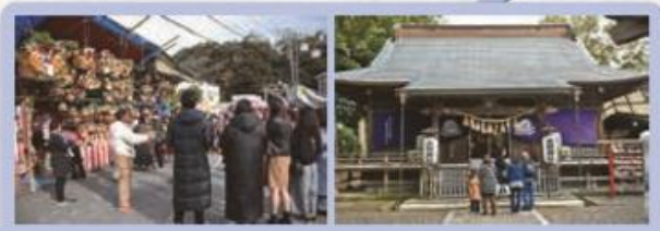
Tori-no-ichi Rake Fair in December Owashi Shrine